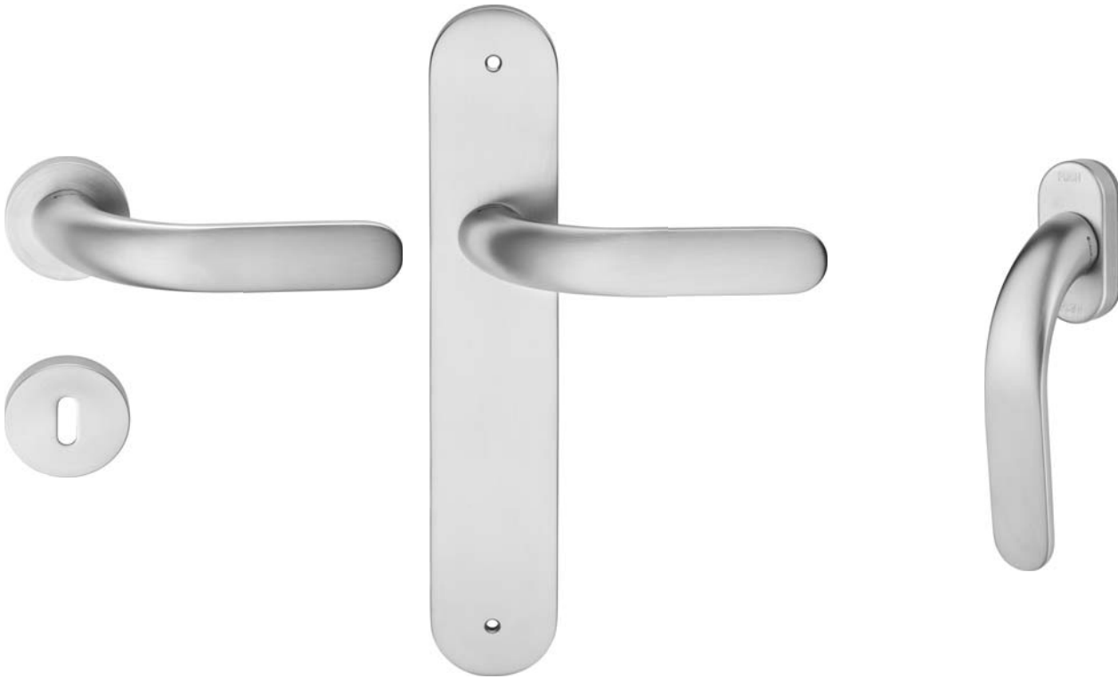
COD. 1595 RB 023