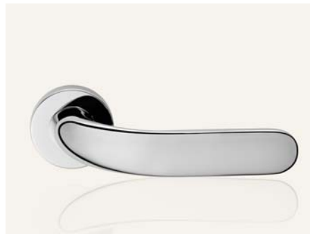
CR cromo lucido polished chrome