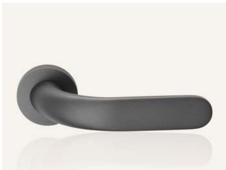
AS antracite satinato satin anthracite