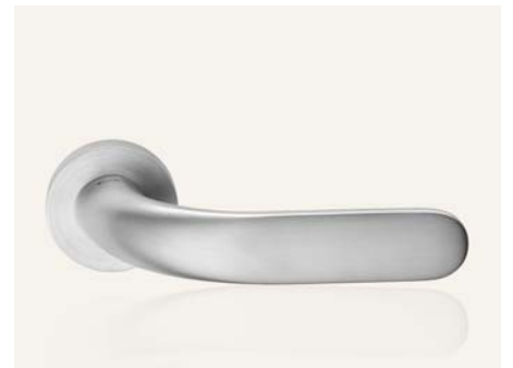
CS cromo satinato satin chrome