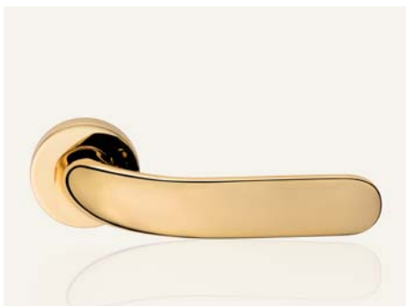
OZ oro zecchino gold plated