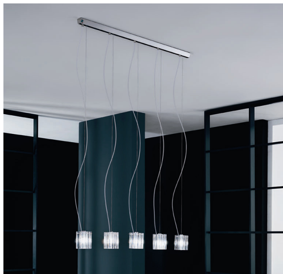
OCHAROS50 CHARLOTTE S5L sospensione lineare