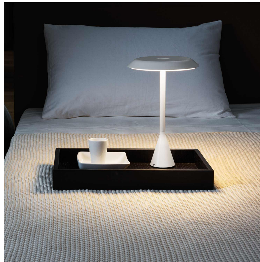
Table lamp with LED sources for a widespread lighting, suitable for domestic and working places. Aluminium structure, polycarbonate diffuser with anti-glare treatment. Available in two versions: Panama and Panama Mini, white or black. Mini available also in the cordless portable rechargeable version. Duration: 10 hours battery life, recharge: 6 hours.