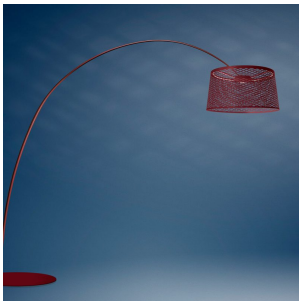
Twice as Twiggy Grid