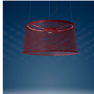
Twice as Twiggy Grid