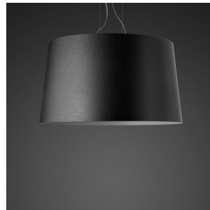
Twice as Twiggy