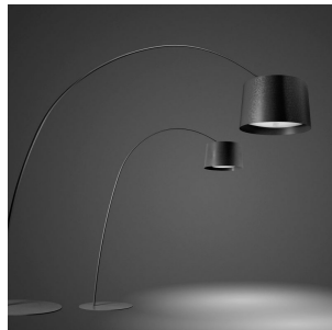
Twice as Twiggy