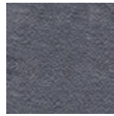
PL73 NERO PERLATO LUCIDO