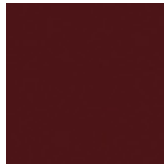
ECP13 ROSSO CORSA