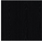
fr73 open pore matt black ashwood