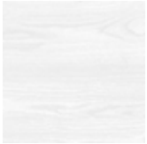
fr71 open pore matt white ashwood