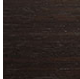
frRB burned oak stained ashwood