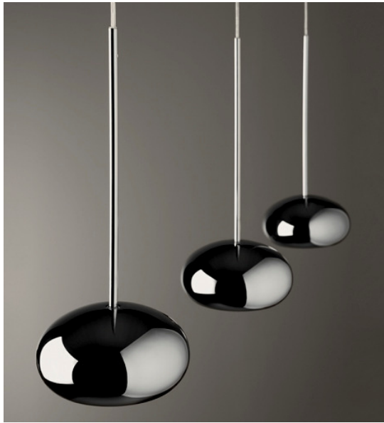
OBOA00SL-3 Boa S3L sospensione lineare