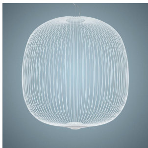
Spokes 2 Large