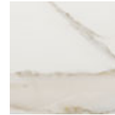
KM06 Golden Calacatta ████████████████████