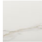
KM05 Golden Calacatta ██████████