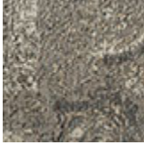
00000000 000000 Chennai