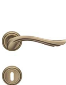
1630 RB 011