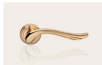
Oro zecchino gold plated OZ