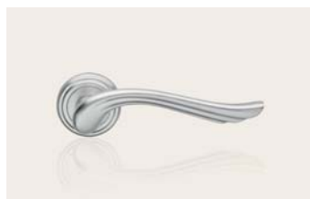
Cromo satinato satin chrome CS