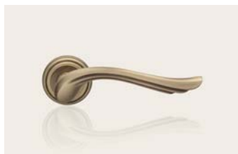
patiné patiné mat PM