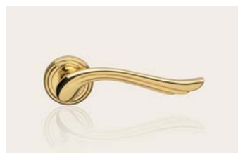
Ottone lucido verniciato polished brass OL