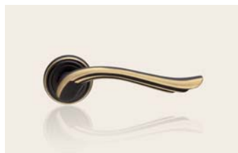
bronzo opaco matt bronze BM