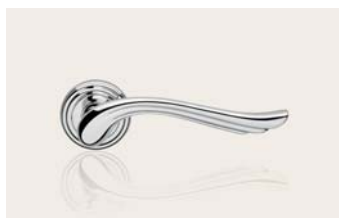
Cromo lucido polished chrome CR