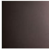
15 satin bronze