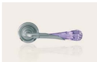
cromo satinato satin chrome CS