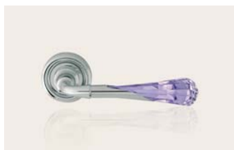
cromo lucido polished chrome CR