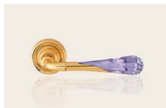
oro zecchino gold plated OZ