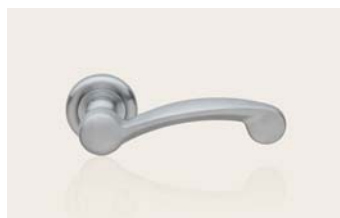
Cromo satinato satin chrome CS