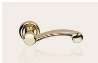
Ottone lucido verniciato polished brass OL