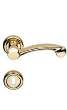
1330 RB 103