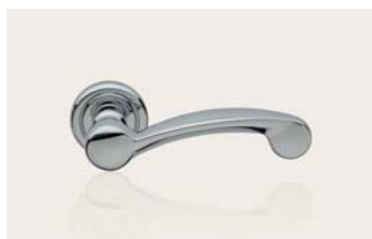
Cromo lucido polished chrome CR