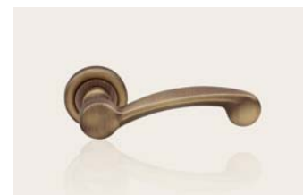
Patiné patiné mat PM