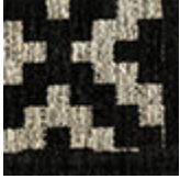
00000000 000000 000000 Halibut